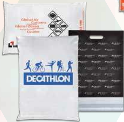
Courier & E-commerce bags