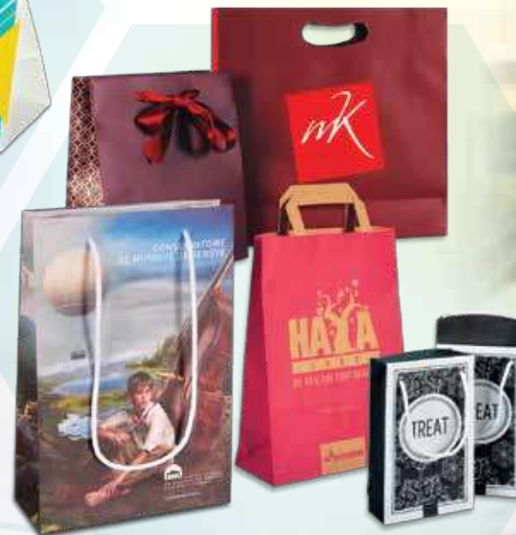
Luxury paper bags & Machine made paper bags