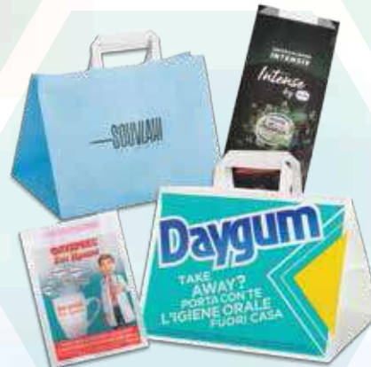
Flat bottom paper bags & Take Away bags